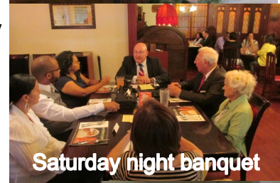
Saturday night banquet